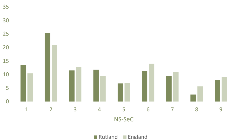
Figure 2: Socio-economic classification 2011 census (All usual residents aged 16 to 74)

Various studies have found that recreational activity in the countryside is more common in the more affluent socio-economic groups. Cycle ownership has also been found to be higher amongst more affluent socio-economic groups 19 .