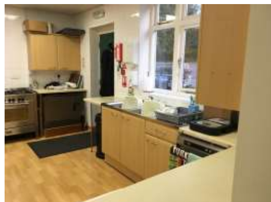
Picture 6 – Kitchen facilities