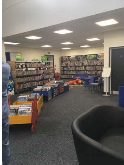
Picture 2 – Available space for Polling station