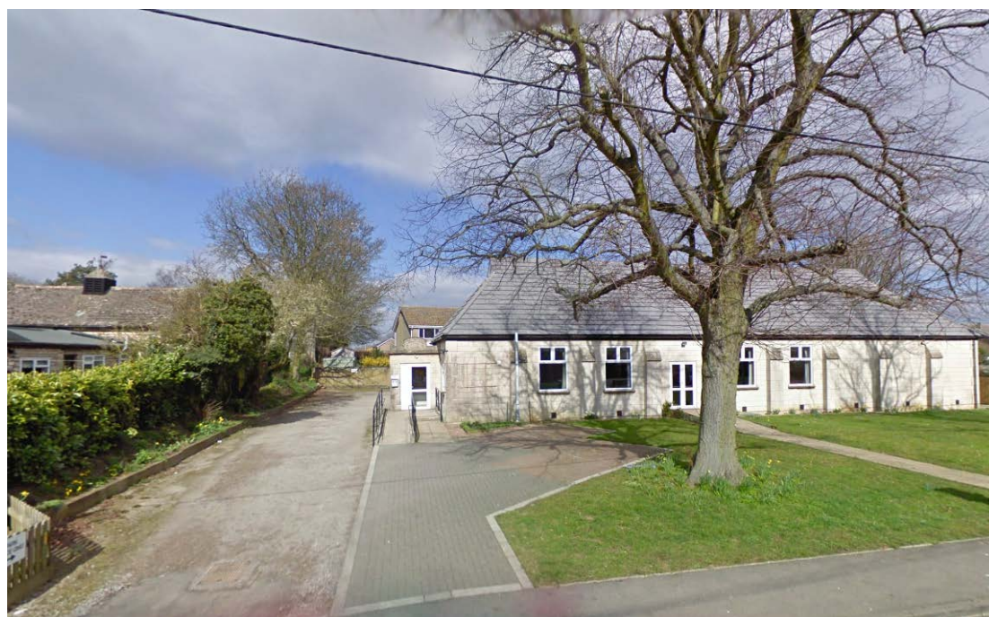
Picture 3 – External view showing disabled parking with ramp access with hand rail