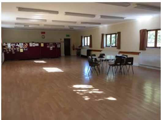
Picture 9 – polling station area