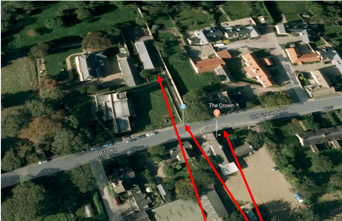
Satellite view of polling station showing entrance and bus stops