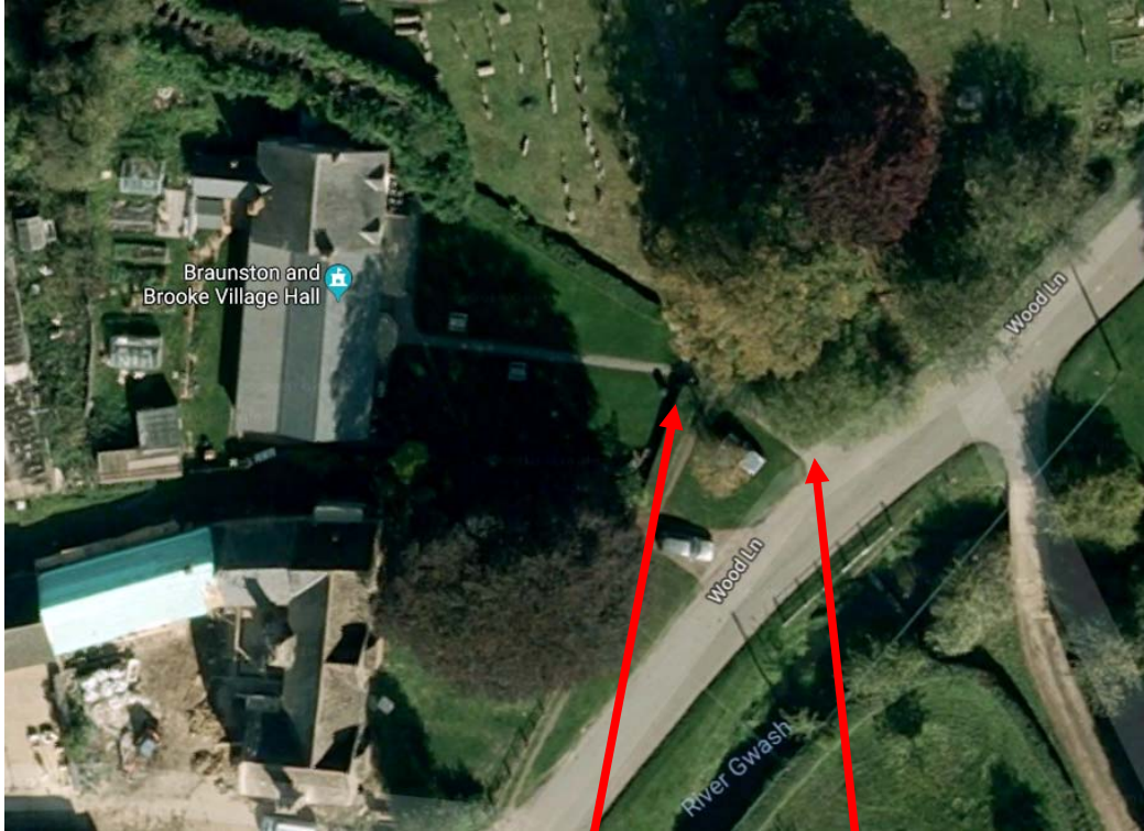
Entrance and on-road parking