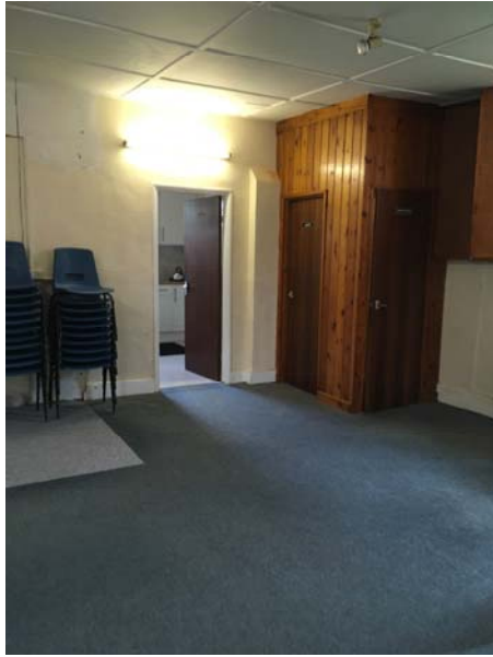
Picture 5 - View from polling area to side room